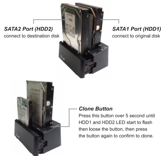
Product Details Figure 4