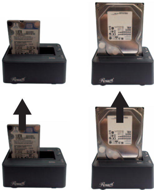
Product Details Figure 2